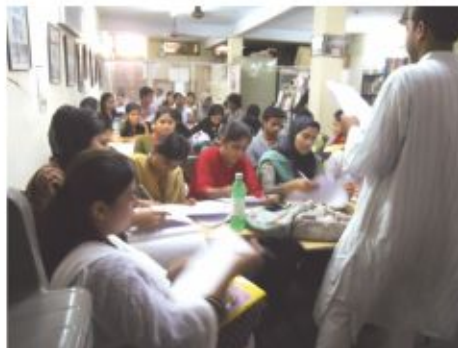
A Day of Brisk activity

Besides this regular educational development program, the Alhikmah Foundation has also been organizing English Language Coaching Classes for the students desirous of improving their lingual proficiency and communication skills. The Foundation is also planning to start Remedial Coaching Classes in different subjects for school drop outs and poor students, especially those coming from minorities.