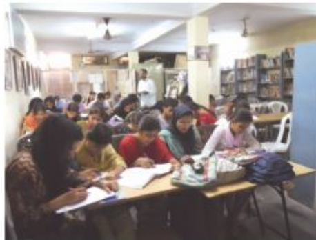
Students at Study Point

when the Alhikmah Coaching was organized for the first time. Coaching for B. Ed. has gained popularity among the students seeking admission. The 'Education Point' has been able to win the trust and confidence of students even from far flung areas of Delhi like Najafgarh, Pitampura, Rohni, Trans Yamuna, and Old Delhi,